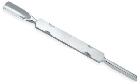
Cuticle Pushers & Cleaners VI-116-1002

Cuticle Pushers Single Ended made of surgical grade stainless steel of Japanese origin makes these tools truly professional and surgical grade allows you to sterilize these after every use.