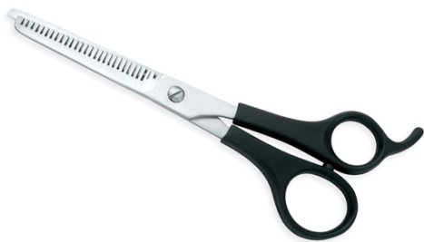
One-Sided Texturing Scissors with finger rest VI-102-1016

&nbsp; This model of Barber thinning Scissors is for the economy users. Made of AISI 420 steel provide long lasting sharpness but for the professional use please see our line of professional Thinning Scissors. 6.5",