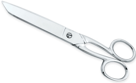
Trimmers Shears VI-110-1001

&nbsp;&nbsp;&nbsp;Trimmers Shears available in Size 8" is heavy duty Scissors for the Clothes and various other uses at home or for the industrial purpose. This Scissors is made out of high carbon Stainless Steel alloy which gives it long lasting sharpness. 8",