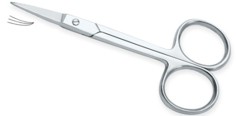
Cuticle Scissors Curved VI-109-1009

&nbsp;&nbsp;&nbsp;<div>&nbsp;&nbsp;&nbsp;</div> <div>This model of Cuticle Scissors is Classic model with small finger holes and very sharp tip which allows a perfect cut for the cuticles.</div> 3.5",