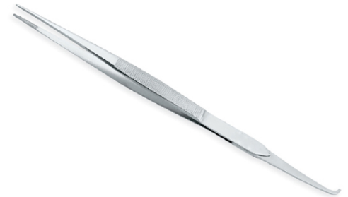
General Purpose Tweezers VI-113-1006

This classic model with serrated Bent tips is used for various purposes from surgical to assembly line and it's available in magnetic and non magnetic steel type. 5.5",