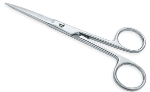
Standard Thinning Scissors VI-104-1006

Made from Selected steel and machined to perfection for smooth thinning operation with 28 teeth single blade thinning Scissors with plastic handles. 6",