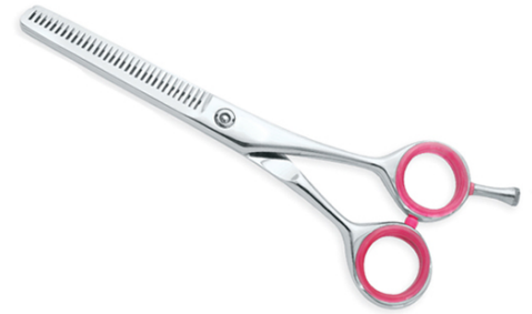
Professional Thinning Scissors VI-102-1009

Available in Stainless steel AISI 420 or 440 with hollow ground inner blades and Convex edge, our best seller with single blade thinning operation of 16 teeth. 6.5",