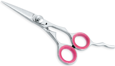
Dainty Professional Barber Scissors VI-101-1019

Available in Stainless steel AISI 420 or 440 with hollow ground inner blades and Convex edge, with double fixed finger rest for stylists who prefer longer finger rest and small cutting blades. 4 1/2",