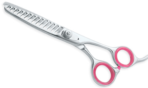
Japanese Professional Thinning Scissors VI-102-1008

Available in Stainless steel AISI 420 or 440 with hollow ground inner blades and Convex edge, 16 teeth single blade Scissors for a smooth action. 5 1/2",