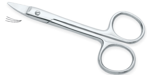
Crown Scissors VI-109-1006

&nbsp;&nbsp;&nbsp;Nose Scissors with probe at the top of the tip helps for the smooth cutting of nose hairs without any injury. Special stainless steel and excellent craftsmanship keep these scissors Sharpe for longer periods. 3½", 4", 4½"