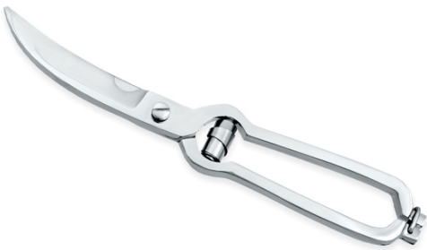
Poultry Shears VI-111-1010

• We are currently offering these Scissors only in the casted version and with one blade micro serrated these scissors can be used for poultry as well as for the leather cutting industry.