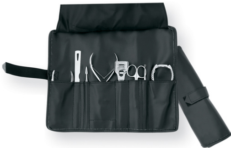
Manicure Kits VI-115-1004

This is Economy version of pocket manicure set , Available in many colors<br />