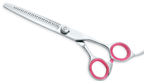
Professional Thinning Scissors VI-102-1011