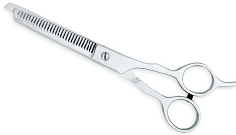
One-Sided Thinning Scissors with finger rest VI-102-1014

&nbsp; This model of Barber thinning Scissors is for the economy users. Made of AISI 420 steel provide long lasting sharpness but for the professional use please see our line of professional Thinning Scissors. 6",