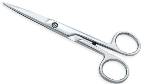
Standard Thinning Scissors VI-104-1005

Made from Selected steel and machined to perfection for smooth texturing operation with 8 teeth single blade texturing Scissors: 6",