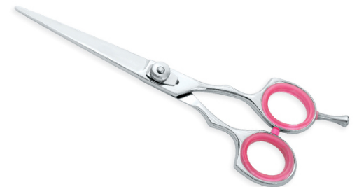
Platinum Touch Professional Barber Scissors VI-101-1018

Professional Barber Scissors Available in Stainless steel AISI 420 or 440 with hollow ground inner blades and Convex edge, One of our best selling model available in many sizes and its equally popular in hair stylists and for people who work for pet grooming. 5.5", 6.5", 7.5", 8.5", 9.5",