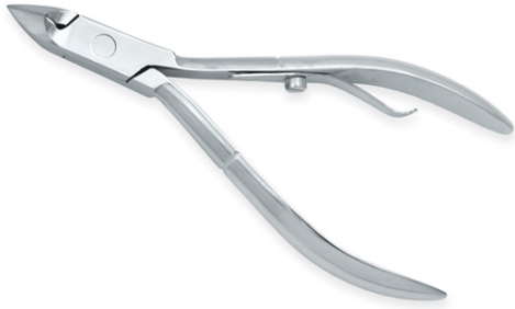
Cuticle Nippers VI-114-1001

Forged from Surgical Grade Stainless Steel with Lap Joint, Single Sheet Spring and finished to perfection. 3.5", 4", 4.5",