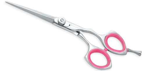
Trendy Professional Barber Scissors VI-101-1021

Available in Stainless steel AISI 420 or 440 with hollow ground inner blades and Convex edge, For the people who wants to have 360 degree movement for their stylish work. 5 1/2", 6",