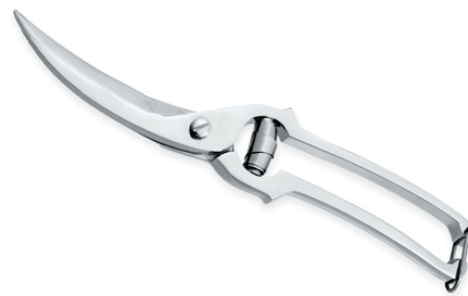
Poultry Shears VI-111-1011

• We are currently offering these Scissors only in the casted version and with one blade micro serrated these scissors can be used for poultry as well as for the leather cutting industry.