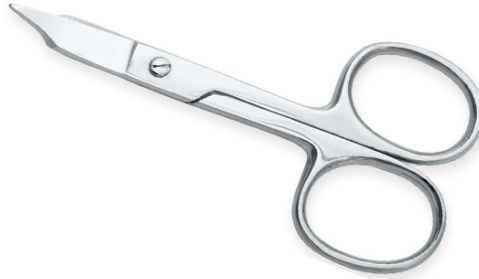
Nail Scissors Curved VI-109-1014

&nbsp;Nail Scissors Curved is also a classic model of Nail Scissors and one of our best sellers. Special grade of stainless steel and excellent craftsmanship makes these scissors last longer and keep them smooth. 3.5",