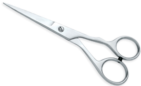
Barber Scissors with finger rest One Blade Micro Serrated VI-103-1010

&nbsp; Made from selected steel and crafted to perfection for smooth operation and sharpness with one blade micro serrated, with removable finger rest, This is ideal model for people looking for Classic models in Economy Scissors. 6.5",