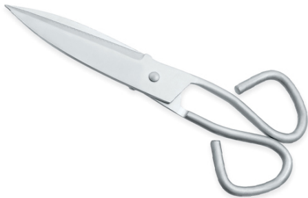
Kitchen Scissors with Wire Handles VI-108-1004

&nbsp;&nbsp;&nbsp;Paper Scissors with two pointed blades is available in Size 7&rdquo; for various uses at home or for the industrial purpose. This Scissors is made out of high carbon Stainless Steel alloy which gives it long lasting sharpness 7",