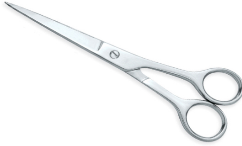
Standard Thinning Scissors VI-104-1002

Made from Selected steel and machined to perfection for smooth thinning operation with 22 teeth single blade thinning Scissors: 6",