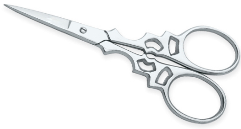
Nail Scissors Straight VI-107-1017

&nbsp;&nbsp;&nbsp;Beautiful design and excellent working ability is one of the features of our range of Fancy Scissors which are made out of Special Steel for long lasting cutting ability 3 ½",