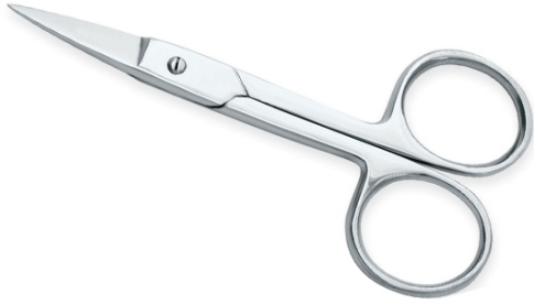
Nail Scissors Curved VI-109-1013

&nbsp;Nail Scissors Curved is also a classic model of Nail Scissors and one of our best sellers. Special grade of stainless steel and excellent craftsmanship makes these scissors last longer and keep them smooth. 3.5",