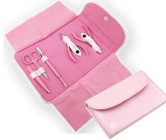
Manicure Kits VI-115-1002

This is pocket manicure sets with leather pouch available in many colors.<br />