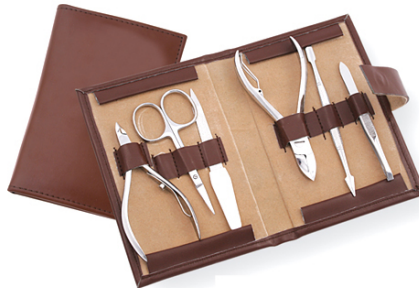
Manicure Kits VI-115-1011

Professional Quality kit with fine quality manicure and pedicure instruments packed in combination of leather, available in different combinations of leather.