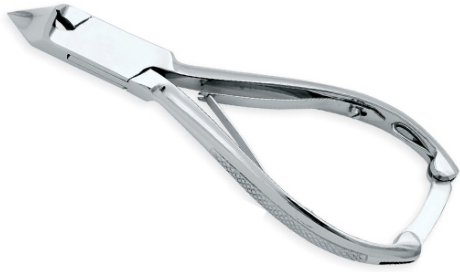
Cuticle Nippers VI-114-1007

Forged from Surgical Grade Stainless Steel with Box Joint, Double Sheet Springs and serrations on handles for strong grip, Ideal for professional pedicure work. 5.5",