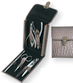
Manicure Kits VI-115-1016

Professional Manicure Set Contains: Cuticle Nippers # 979 Nail Scissors # 858 Nail File # 105