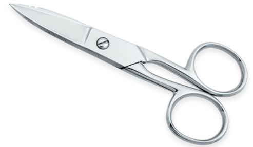
Cable Scissors VI-110-1003

&nbsp;&nbsp;&nbsp;<div>&nbsp;&nbsp;&nbsp;</div> <div>This heavy duty version of Trimmers Shears is also useful for the leather industry. High Carbon Stainless Steel provides long lasting sharpness.</div> 8",