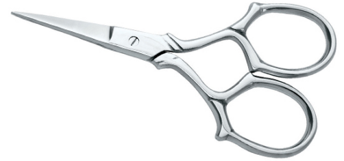
Fancy Scissors VI-107-1015

&nbsp;&nbsp;&nbsp;Beautiful design and excellent working ability is one of the features of our range of Fancy Scissors which are made out of Special Steel for long lasting cutting ability 3 ½",