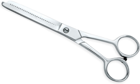
Two sided Thinning Scissors VI-102-1019

&nbsp;Made out of Stainless steel of AISI 420 of Pakistani Origin, This Scissors is ideal for the Economy or standard market but for professional users please see our line of professional thinning scissors. 6",