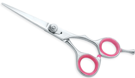
Smooth Professional Barber Scissors VI-101-1022

Available in Stainless steel AISI 420 or 440 with hollow ground inner blades and Convex edge, balanced and trendy model for a smooth cut. 6",