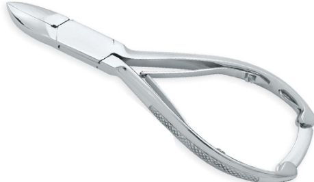
Cuticle Nippers VI-114-1005

Forged from Surgical Grade Stainless Steel with Lap Joint, Barrel Spring and textures handles ideal for professional work of pedicure. 4.5", 5", 5.5",