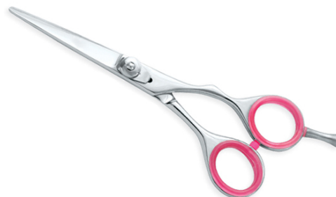
TP Professional Barber Scissors VI-101-1023

Available in Stainless steel AISI 420 or 440 with hollow ground inner blades and Convex edge, One of our best seller in conventional models, ideal for a smooth cut. 5", 5.5", 6",