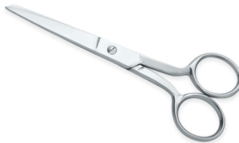
Household Scissors VI-108-1005

Paper Scissors with two pointed blades is available in Size 7&rdquo; for various uses at home or for the industrial purpose. This Scissors is made out of high carbon Stainless Steel alloy which gives it long lasting sharpness 8",