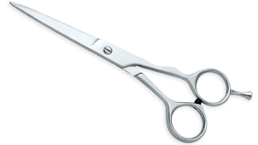
Barber Scissors with finger rest One Blade Micro Serrated VI-103-1009

&nbsp; Made from selected steel and crafted to perfection for smooth operation and sharpness with one blade micro serrated, finger rest, This is ideal model for people looking for smaller blades in Economy Scissors. 6.5",