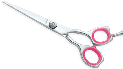
MR Professional Barber Scissors VI-101-1026

Available in Stainless steel AISI 420 or 440 with hollow ground inner blades and Convex edge, an ultimate samurai shape model for perfect cut. 6",