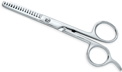
Two Sided Thinning Scissors VI-102-1013

&nbsp; This model of Barber thinning Scissors is for the economy users. Made of AISI 420 steel provide long lasting sharpness but for the professional use please see our line of professional Thinning Scissors. 6",