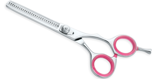
Professional Thinning Scissors VI-102-1003

&nbsp; Available in Stainless steel AISI 420 or 440 with hollow ground inner blades and Convex edge, 42 teeth Thinning scissors for a smooth cut. 5 1/2",6",