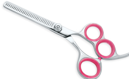
Professional Thinning Scissors VI-102-1005

&nbsp; Available in Stainless steel AISI 420 or 440 with hollow ground inner blades and Convex edge, 28 teeth thinning scissors which classic ergonomic handles. 5.5",6",