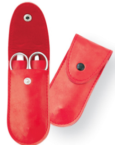
Manicure Kits VI-115-1006

Manicure & pedicure set packed in fine leather and velvet pouch<br />