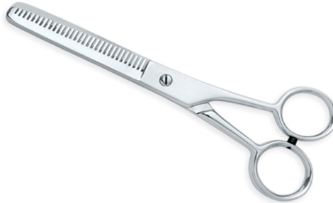
Two Sided Thinning Scissors VI-102-1020

&nbsp;Made out of Stainless steel of AISI 420 of Pakistani Origin, This Scissors is ideal for the Economy or standard market but for professional users please see our line of professional thinning scissors. 6",