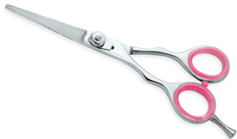
Left Handed Professional Barber Scissors VI-101-1004

&nbsp;Available in Stainless steel AISI 420 or 440 with hollow ground inner blades and Convex edge, One of all time favorite available is four sizes , equally popular in hairstylists and pet grooming industry 5.5", 6.5", 8.5", 9, 1/2",