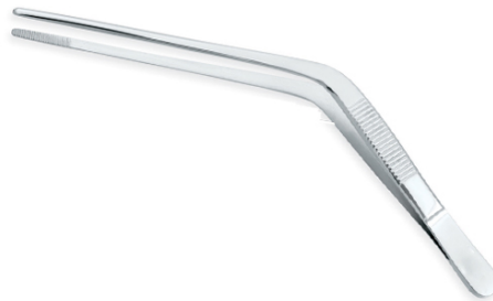
General Purpose Tweezers VI-113-1005

This classic model with serrated Bent tips is used for various purposes from surgical to assembly line and it's available in magnetic and non magnetic steel type. 5.5", 6",