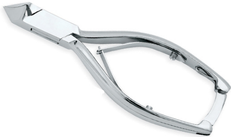
Cuticle Nippers VI-114-1016

Forged from Surgical Grade Stainless Steel with Special multi Joints, and smooth cutting operation for professional work. 6.5",