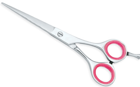
Real Smooth Professional Barber Scissors VI-101-1016

Available in Stainless steel AISI 420 or 440 with hollow ground inner blades and Convex edge, Ultra light weight and small blades makes it choice of stylists who want a Scissors with small blades. 4 1/2",