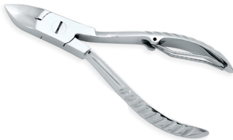
Cuticle Nippers VI-114-1028

Forged from Surgical Grade Stainless Steel with Box Joint, Double Sheet Spring, Lock back handles for professional work. 5.5",