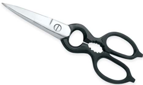
Kitchen Scissors VI-108-1010

&nbsp;Sewing Scissors with plastic handle is rather lighter and cheaper option for the household scissors yet it provides excellent cutting ability and long lasting sharpness 7",8",