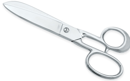
Trimmers Shears VI-110-1002

&nbsp;&nbsp;&nbsp;Trimmers Shears available in Size 8" is heavy duty Scissors for the Clothes and various other uses at home or for the industrial purpose. This Scissors is made out of high carbon Stainless Steel alloy which gives it long lasting sharpness. 8",