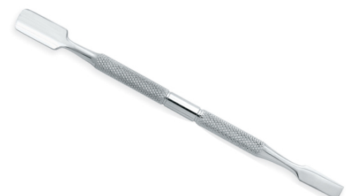
Cuticle Pushers & Cleaners VI-116-1006

Cuticle Pushers Double Ended made of surgical grade stainless steel of Japanese origin makes these tools truly professional and surgical grade allows you to sterilize these after every use.