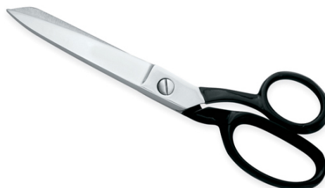
Trimmers Shears Painted Handles VI-110-1005

&nbsp;&nbsp;&nbsp;We offer two versions in this model, one for the quality conscious market with forged items and one standard quality version with casted items ideal for the price sensitive market. 7", 8", 9",