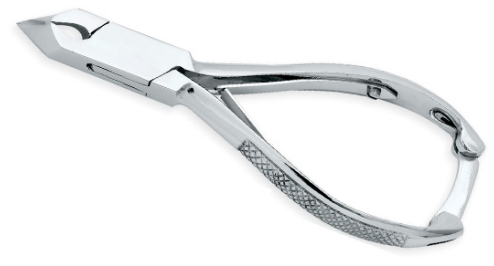
Cuticle Nippers VI-114-1027

Forged from Surgical Grade Stainless Steel with Lap Joint, Barrel Sheet Spring and finished to perfection 4.75",