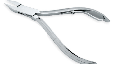
Cuticle Nippers VI-114-1006

Forged from Surgical Grade Stainless Steel with Box Joint, double Sheet Springs for smooth operation and ideal for professional pedicure work. 5.5",