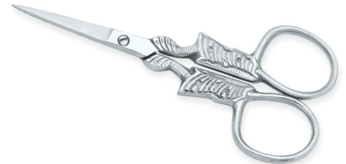
Butterfly Scissors VI-107-1021

Beautiful design and excellent working ability is one of the features of our range of Fancy Scissors which are made out of Special Steel for long lasting cutting ability. 3.5",