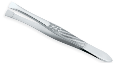
Eyebrow Tweezers VI-112-1012 &nbsp;Eyebrow Tweezers 3.5",4",