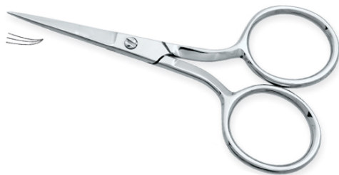
Embroidery Scissors Curved with Bigger Finger Holes VI-107-1023

Beautiful design and excellent working ability is one of the features of our range of Fancy Scissors which are made out of Special Steel for long lasting cutting ability. 3.5",