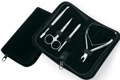
Manicure Kits VI-115-1010

Contains: Nail Pusher # 124, 116, 133, 144, 119, 139, 128, 135. Choose any 8 Different modles From our large range of Quality Pushers & Cleaners.