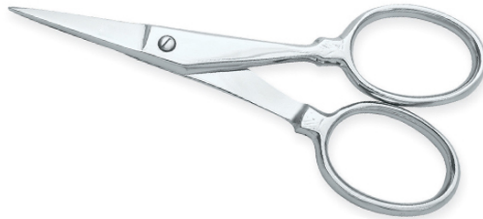
Fancy Scissors VI-107-1020

Beautiful design and excellent working ability is one of the features of our range of Fancy Scissors which are made out of Special Steel for long lasting cutting ability. 3½",