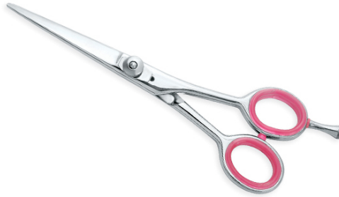
JN Professional Barber Scissors VI-101-1014

Available in Stainless steel AISI 420 or 440 with hollow ground inner blades and Convex edge, Conventional model for the stylist who likes to keep it simple. 5", 5 1/2", 6", 7",