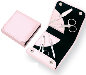
Manicure Kits VI-115-1001

This is pocket manicure sets with leather pouch available in many colors.<br />