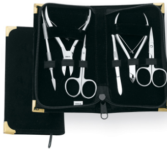
Manicure Kits VI-115-1008

Essential for every manicure & Pedicure professional, packing available in different colors of velvet and leather pouches