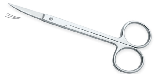
Fine Scissors Curved VI-111-1006

&nbsp; Available in assorted sizes this model of Fine Scissors can be used in different areas like it can be used as Cuticle Scissors, Nail Scissors, and Embroidery Scissors as well as for any other industrial or home use. 3.5", 4", 4.5",