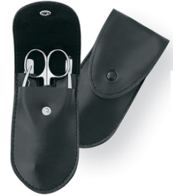
Manicure Kits VI-115-1003

Manicure Set Contains:<br /> Nail Nipper # 914<br /> Tweezers # 081<br /> Cuticle Nippers # 911<br /> Pushers # 146<br /> Nail Scissors # 856<br />