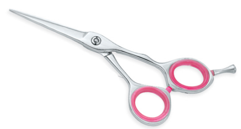
Rony Professional Barber Scissors VI-101-1027

Available in Stainless steel AISI 420 or 440 with hollow ground inner blades and Convex edge, An extension of conventional models with some new look. 6",