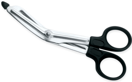
Utility Scissors VI-111-1001

&nbsp; Blades of this utility Scissors are made out of high Carbon Japanese Stainless Steel Sheet and handles with Plastic, One blade micro serrated makes these Scissors perfect to cut anything from paper to heavy cloth or bandage in case of any emergency. 6",