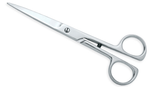
Barber Scissors One Blade Micro Serrated VI-103-1012

&nbsp; Made from selected steel and crafted to perfection for smooth operation and sharpness with one blade micro serrated, with removable finger rest, This is ideal model for people looking for Economic Scissors with modern designs.