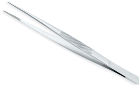
General Purpose Tweezers VI-113-1002

This classic model with serrated rounded tips is used for various purposes from surgical to assembly line and it's available in magnetic and non magnetic steel type. 4", 4.5", 5", 5.5", 6", 7", 8", 10", 12",