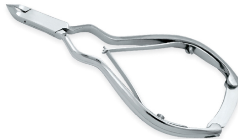
Cuticle Nippers VI-114-1017

Forged from Surgical Grade Stainless Steel with Box Joint, Double Sheet Spring and lock back handles for professional work. 5.5",