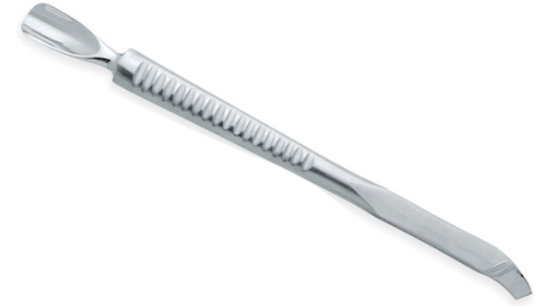
Cuticle Pushers & Cleaners VI-116-1003

Cuticle Pushers Double Ended made of surgical grade stainless steel of Japanese origin makes these tools truly professional and surgical grade allows you to sterilize these after every use.