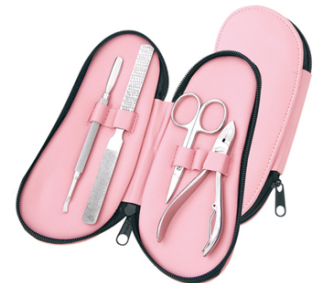
Manicure Kits VI-115-1012

Manicure Set Contains: Tweezers # 920 Pushers # 129 Nail Nippers # 914 Nail File # 105 Cuticle Scissors # 852 Cuticle Nippers # 911