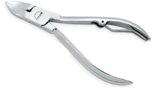
Cuticle Nippers VI-114-1003

Forged from Surgical Grade Stainless Steel with Box Joint, Single Sheet Spring and finished to perfection 3.5", 4",