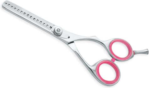
Professional Thinning Scissors VI-102-1007

Available in Stainless steel AISI 420 or 440 with hollow ground inner blades and Convex edge, 16 teeth single blade Scissors for a smooth action. 5 1/2",