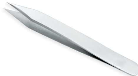
Tweezer VI-112-1011 &nbsp;Tweezer with fine point ideal for removal of fine or coarse hairs at the root 3",3.5",4",