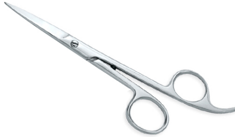
Barber Scissors Surgical Type VI-103-1008

&nbsp; Made from selected steel and crafted to perfection for smooth operation and sharpness with one blade micro serrated, finger rest, This is ideal model for people looking for smaller blades in Economy Scissors. 5.5",