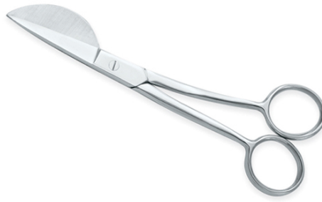
Candle Shears VI-111-1008

• It's ergo design and made out of special steel with excellent craftsmanship this scissors is a must for any line of utility Scissors. This is lighter version and we also have a heavier version of the same.