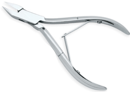
Cuticle Nippers VI-114-1010

Forged from Surgical Grade Stainless Steel with Box Joint, Double Sheet Springs and lock back handles, ideal for professional work. 4.5", 5",