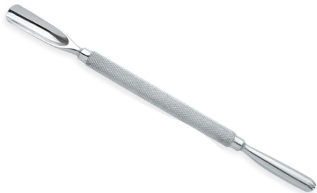
Cuticle Pushers & Cleaners VI-116-1004

Cuticle Pushers Double Ended made of surgical grade stainless steel of Japanese origin makes these tools truly professional and surgical grade allows you to sterilize these after every use.