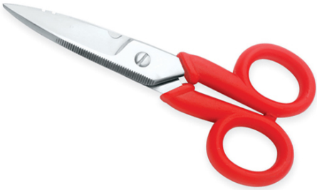
Wire Scissors VI-111-1007

• This Classic model of Wire cutting Scissors is offered with different color of handles and heavy sheet of blades with high carbon steel makes these scissors durable and sharpness also lost longer.