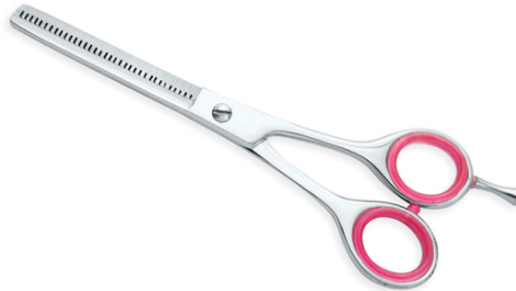
Professional Thinning Scissors VI-102-1002

&nbsp; Available in Stainless steel AISI 420 or 440 with hollow ground inner blades and Convex edge, Single blade thinning Scissors with 42 teeth for a smooth thinning operation. 5 1/2",