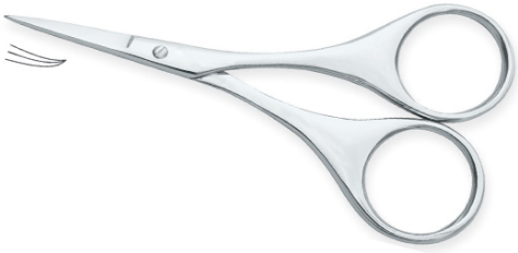
Fancy Scissors VI-107-1019

Beautiful design and excellent working ability is one of the features of our range of Fancy Scissors which are made out of Special Steel for long lasting cutting ability. 3½",