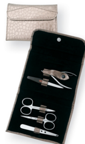
Manicure Kits VI-115-1017

Manicure Set Contains: Nail Nippers # 914 Cuticle Nippers # 911 Tweezers # 081