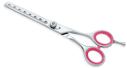
Professional Thinning Scissors VI-102-1006

&nbsp; Available in Stainless steel AISI 420 or 440 with hollow ground inner blades and Convex edge, With three finger handle and 34 teeth single blade thinning scissors. 6 1/2",