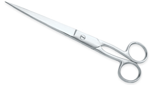
Paper Scissors VI-110-1009

We offer two versions in this model, one for the quality conscious market with forged items and one standard quality version with casted items ideal for the price sensitive market. 7", 8", 9", 10", 12",