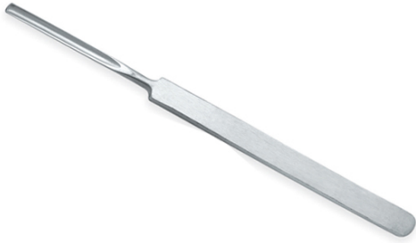
Cuticle Pushers & Cleaners VI-116-1001

Cuticle Pushers Single Ended made of surgical grade stainless steel of Japanese origin makes these tools truly professional and surgical grade allows you to sterilize these after every use.