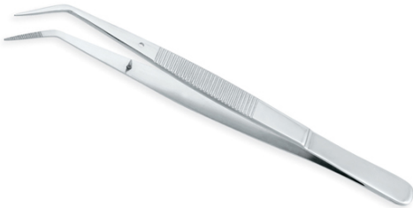
General Purpose Tweezers VI-113-1004

This classic model with serrate Bent tips is used for various purposes from surgical to assembly line and it's available in magnetic and non magnetic steel type. 5.5", 6", 8",