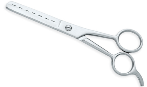
One-Sided Thinning Scissors with finger rest VI-102-1015

&nbsp; This model of Barber thinning Scissors is for the economy users. Made of AISI 420 steel provide long lasting sharpness but for the professional use please see our line of professional Thinning Scissors. 6.5",