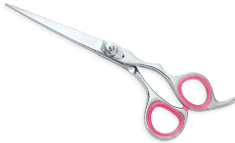
Mod Style Professional Barber Scissors VI-101-1002

&nbsp;Available in Stainless steel AISI 420 or 440 with hollow ground inner blades and convex edge, Detachable finger rest makes it favorite choice for the stylists who prefer simple and conventional models 5", 5.5", 6",