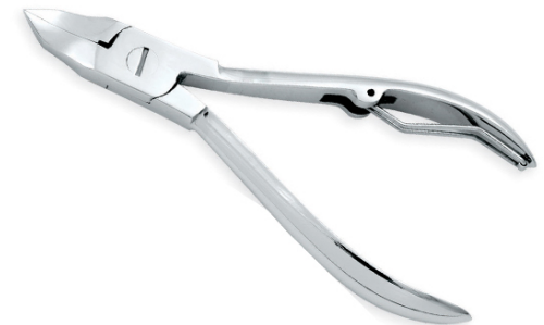
Cuticle Nippers VI-114-1030

Forged from Surgical Grade Stainless Steel with Lap Joint, Single Wire Spring and fine point for professional work 4.75",