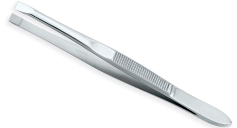
Eye Brow Tweezers VI-112-1003 with thumb grip on handles 3", 3.5", 4",