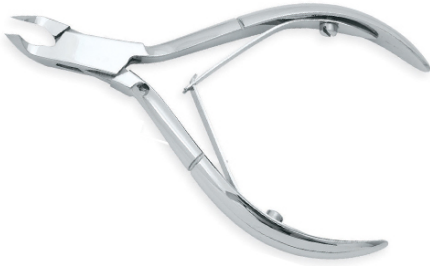
Cuticle Nippers VI-114-1025

Forged from Surgical Grade Stainless Steel with Box Joint, Double Sheet Spring and finished to perfection 4",