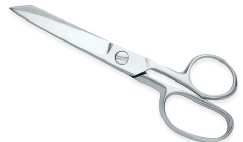
Trimmers Shears VI-110-1006

&nbsp;&nbsp;&nbsp;We offer two versions in this model, one for the quality conscious market with forged items and one standard quality version with casted items ideal for the price sensitive market. 7", 8", 9",