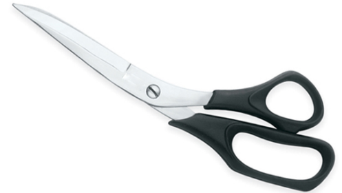
Sewing Scissors With Plastic Handles VI-108-1009

&nbsp;Household Scissors with plastic handle is rather lighter and cheaper option for the household scissors yet it provides excellent cutting ability and long lasting sharpness. 5",6",