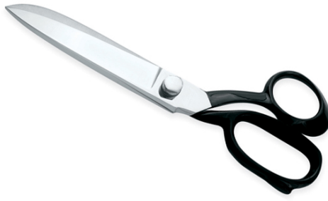
Tailor Shears VI-110-1008

We offer two versions in this model, one for the quality conscious market with forged items and one standard quality version with casted items ideal for the price sensitive market. 8", 10", 10",