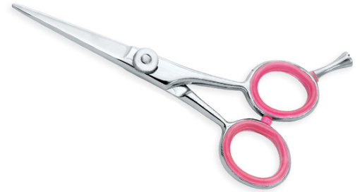
Light Weight Professional Barber Scissors VI-101-1015

Available in Stainless steel AISI 420 or 440 with hollow ground inner blades and Convex edge, Another model with samurai type blades for a creative cut. 6 1/2",