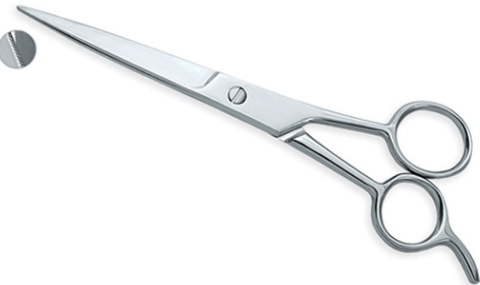
Standard Thinning Scissors VI-104-1004

Made from Selected steel and machined to perfection for smooth thinning operation with 24 teeth single blade thinning Scissors: 6½",