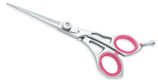
Rony Professional Barber Scissors VI-101-1030

Available in Japanese AISI 420 & 440 Scissors with Convex Edge provides excellent performance for the slide cut as well as for the straight cut. Japanese Steel and excellent craftsmanship ensures that Scissors stay sharper for longer periods. 6.5",