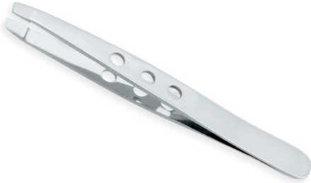
Flat Eye Brow VI-112-1001 Tweezers, Perforated 3", 3.5", 4",