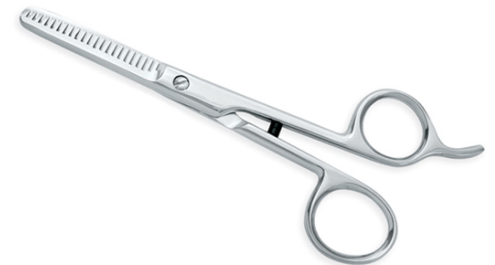
One-Sided Thinning Scissors with finger rest with finger rest VI-102-1012

This model of Barber thinning Scissors is for the economy users. Made of AISI 420 steel provide long lasting sharpness but for the professional use please see our line of professional Thinning Scissors. 6",