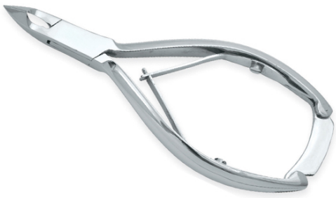
Cuticle Nippers VI-114-1013

Forged from Surgical Grade Stainless Steel with Box Joint, Double Sheet Springs for smooth operation. 5.5",