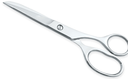
Sewing Scissors VI-108-1002

&nbsp;&nbsp;&nbsp;Sewing Scissors with two pointed blades is available in Size 8&rdquo;, 10&rdquo; for various uses at home or for the industrial purpose. This Scissors is made out of high carbon Stainless Steel alloy which gives it long lasting sharpness 8", 10",