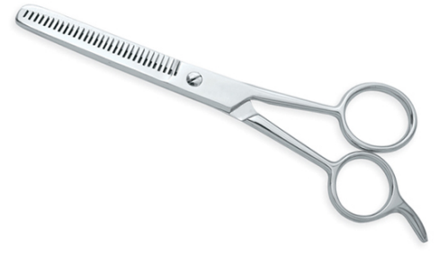
Two Sided Thinning Scissors VI-102-1021

&nbsp;This model of Barber thinning Scissors is for the economy users. Made of AISI 420 steel provide long lasting sharpness but for the professional use please see our line of professional Thinning Scissors. 6",7",