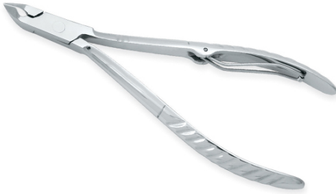
Cuticle Nippers VI-114-1019

Forged from Surgical Grade Stainless Steel with Lap Joint, Single Wire Spring and light handles for smooth operations 5",