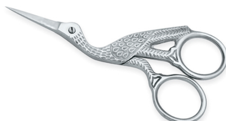
Embroidery Scissors VI-107-1005

&nbsp; Classic model of Embroidery Scissors has passed the test of time and still is one of the best selling models for the range of Embroidery Scissors. This Classic model is made from Special Steel alloy which allows excellent smoothness and long lasting sharpness. 3½", 4½"