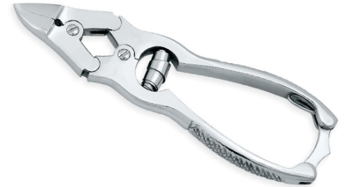
Cuticle Nippers VI-114-1015

Forged from Surgical Grade Stainless Steel with Box Joint, Double Sheet Springs and lock back handles for professional work. 5",