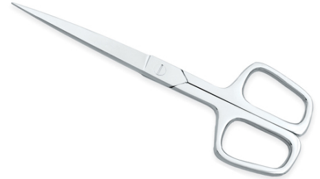
Paper Scissors Heavy Duty VI-108-1003

&nbsp;&nbsp;&nbsp;Sewing Scissors with one pointed and one round blade is available in Size 6&rdquo;, 7&rdquo;, 8&rdquo; for various uses at home or for the industrial purpose. This Scissors is made out of high carbon Stainless Steel alloy which gives it long lasting sharpness 6", 7", 8",