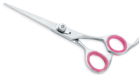
Super Smooth Professional barber Scissors VI-101-1017

Professional Barber Scissors 5", 5 1/2", 6",