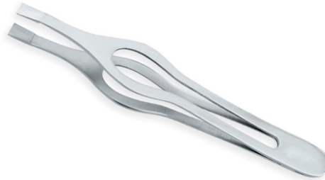
Eye Brow Tweezers VI-112-1008 &nbsp;Eye Brow Tweezers 4",