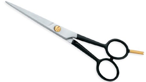
Barber Scissors with finger rest One Blade Micro Serrated VI-103-1013

&nbsp;&nbsp;&nbsp;Made from selected steel and crafted to perfection for smooth operation and sharpness with one blade micro serrated, No finger rest, This is ideal model for people looking for Economic Scissors with classic models. 6.5",