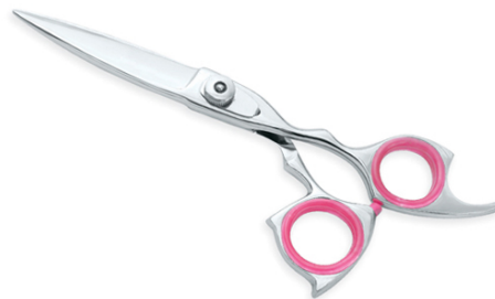
Professional Barber Scissors. VI-101-1029

Available in Japanese AISI 420 & 440 Scissors with Convex Edge provides excellent performance for the slide cut as well as for the straight cut. Japanese Steel and excellent craftsmanship ensures that Scissors stay sharper for longer periods. 6.5",