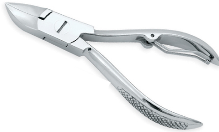
Cuticle Nippers VI-114-1008

Forged from Surgical Grade Stainless Steel with Box Joint, Double Sheet Springs and serrations on handles for strong grip, Ideal for professional pedicure work. 5.5",