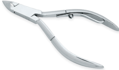
Cuticle Nippers VI-114-1002

Forged from Surgical Grade Stainless Steel with Lap Joint, Single Sheet Spring and finished to perfection. 3.5", 4", 4.5",