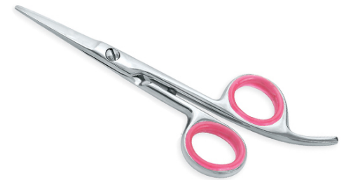
Delicate Cut Professional Barber Scissors VI-101-1006

&nbsp;Available in Stainless steel AISI 420 or 440 with hollow ground inner blades and Convex edge, One of the Top selling model as its highly ergonomic design makes it easy for the people who work all day long. 5, 1/2", 6",