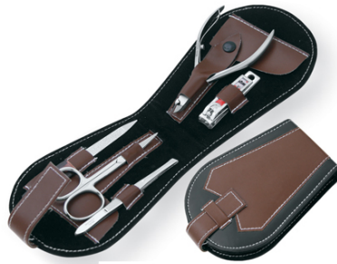
Manicure Kits VI-115-1014

Manicure Set Contains: Nail Nippers Cuticle Nippers # 911 Nail Scissors # 858 Cuticle Pusher # 144