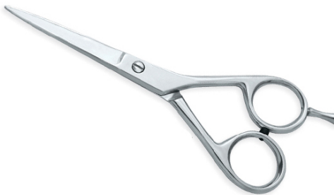
Barber Scissors with finger rest One Blade Micro Serrated VI-103-1011

&nbsp; Made from selected steel and crafted to perfection for smooth operation and sharpness with one blade micro serrated, No finger rest, This is ideal model for people looking for Economic Scissors with modern designs. 5.5",