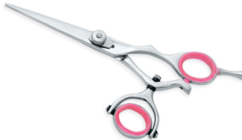
Revolving Thumb Professional Barber Scissors VI-101-1020

Available in Stainless steel AISI 420 or 440 with hollow ground inner blades and Convex edge, with double fixed finger rest for stylists who prefer longer finger rest and small cutting blades. 4 1/2",