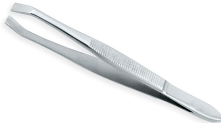
Eye Brow Tweezers VI-112-1005 with texture on handles for grip 3", 3.5", 4",