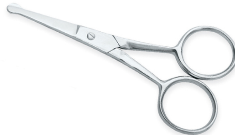
Nose Scissors VI-109-1005

&nbsp;&nbsp;&nbsp;Baby Scissors Curved is designed with rounded tips to babies are not hurt when they move their hands while working on their nails. Designed with precision edges and special stainless which enables its cutting ability last longer 3.5"