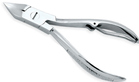
Cuticle Nippers VI-114-1029

Forged from Surgical Grade Stainless Steel with Lap Joint, Single Wire Spring with serrated handles for Grip 4", 4.75",