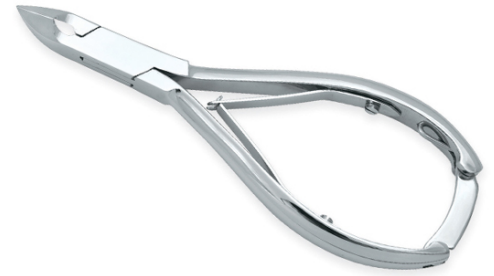
Cuticle Nippers VI-114-1009

Forged from Surgical Grade Stainless Steel with Lap Joint, Single wire Spring and serrated handles for grip. 4", 4.5", 4.75", 5",