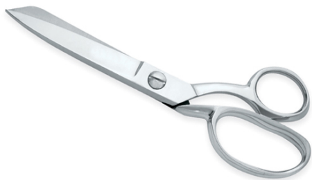
Trimmers Shears VI-110-1004

&nbsp;&nbsp;&nbsp;This version of Cable Scissors with full stainless steel handle is strong substitute of Cable Scissors with plastic handle. Serration on the outer side of Blades provides required features for the electricians to work. 5",