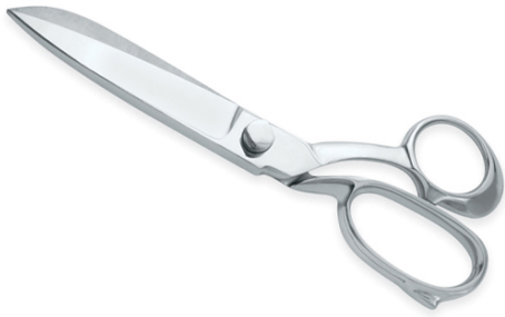
Tailor Shears VI-110-1007

We offer two versions in this model, one for the quality conscious market with forged items and one standard quality version with casted items ideal for the price sensitive market. 8", 10", 10",