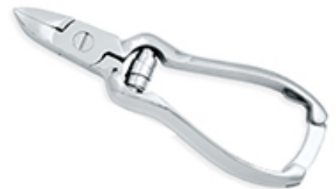
Cuticle Nippers VI-114-1012

Forged from Surgical Grade Stainless Steel with Box Joint, Double Sheet Springs, lock back handles for professional work. 5",