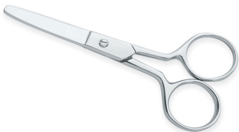
Button Whole Scissors