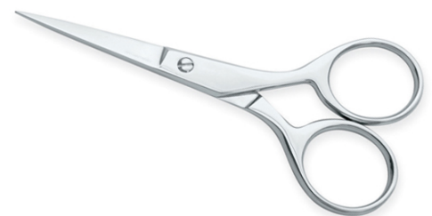
Pocket Scissors VI-107-1006

&nbsp; Classic mode of Embroidery Scissors has passed the test of time and still is one of the best selling model for the range of Embroidery Scissors. This Classic mode is made from Special Steel alloy which allows excellent smoothness and long lasting&nbsp;