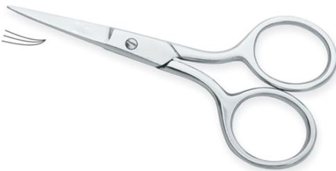
Stork Scissors VI-107-1004

&nbsp; Classic model of Embroidery Scissors has passed the test of time and still is one of the best selling model for the range of Embroidery Scissors. This Classic model is made from Special Steel alloy which allows excellent smoothness and long lasting sharpness. 3.5,4"