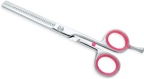
Professional Thinning Scissors VI-102-1001

&nbsp; Available in Stainless steel AISI 420 or 440 with hollow ground inner blades and Convex edge, Single blade thinning Scissors with 42 teeth for a smooth thinning operation. 5 1/2",