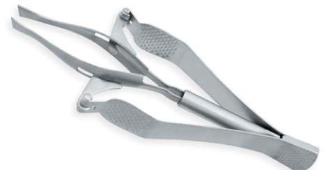
Automatic Tweezer VI-112-1006 Automatic Tweezer 3", 3.5", 4",