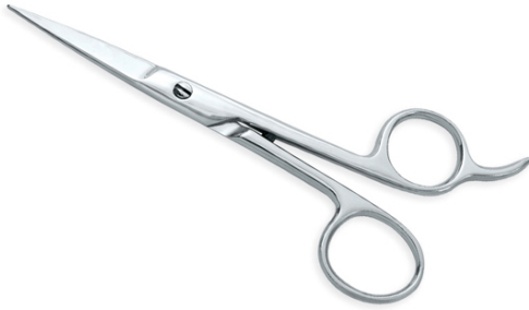
Scissors Surgical Type One Blade Micro Serrated VI-103-1007

&nbsp; Made from selected steel and crafted to perfection for smooth operation and sharpness with one blade micro serrated, finger rest, This is ideal model for people looking for smaller blades in Economy Scissors. 5.5",