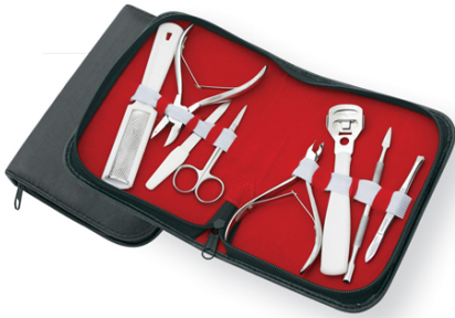
Manicure Kits VI-115-1007

Essential for every manicure & Pedicure professional, packing available in different colors of velvet and leather pouches