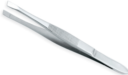
Eye Brow Tweezers VI-112-1002 With texture on handles for grip 3", 3.5", 4",