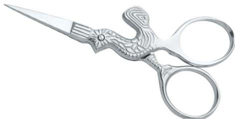
Fancy Embroidery Scissors