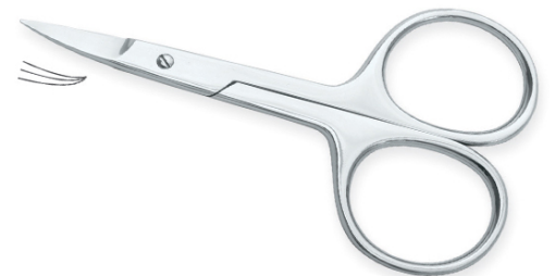
Cuticle Scissors Straight VI-107-1018

&nbsp;&nbsp;&nbsp;This model of nail scissors is a breakaway from the traditional models as its modern trendy and nicely balanced to perform excellent operation for all sort of nails. Special Steel used for this Scissors makes it special. 3½",