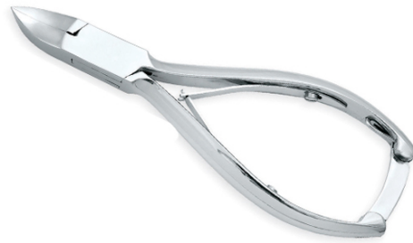
Cuticle Nippers VI-114-1014

Forged from Surgical Grade Stainless Steel with Box Joint, Double Sheet Springs for smooth operation. 5.5",