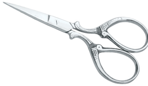
Fancy Scissors VI-107-1014

&nbsp;&nbsp;&nbsp;Beautiful design and excellent working ability is one of the features of our range of Fancy Scissors which are made out of Special Steel for long lasting cutting ability 4",