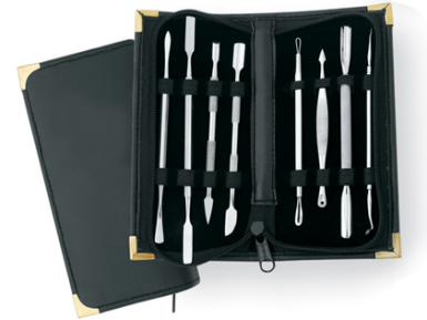
Manicure Kits VI-115-1009

Economy version of manicure set in velvet pouch.