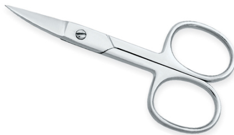
Nail Scissors Curved VI-109-1017

&nbsp;Nail Scissors Tower point is designed to cut your normal hairs with perfection as well as to cut your ingrown nails with it sharply grinded tip. Nail Scissors Straight is also a classic model of Nail Scissors and one of our best sellers. Special grade of stainless steel and excellent craftsmanship makes these scissors last longer and keep them smooth. <div>&nbsp;</div> 3.5",