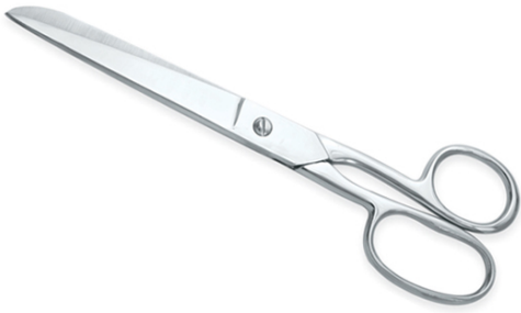
Sewing Scissors VI-108-1007

&nbsp;Sewing Scissors is available in assorted sizes for the varied operations for the household as well as for the industrial purposes. Excellent craftsmanship makes these scissors a special one to be used for comfort and ease..... 6",7,8",