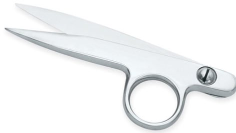
Weaver Scissors Curved VI-107-1002

&nbsp; Weaver Scissors is made from high carbon Stainless steel with excellent craftsmanship allow weavers to snip the thread with great ease and comfort, This is one of our best selling embroidery tool. 4.5"