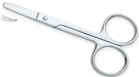
Baby Scissors Curved VI-109-1004

&nbsp;&nbsp;&nbsp;Baby Scissors Straight is designed with rounded tips to babies are not hurt when they move their hands while working on their nails. Designed with precision edges and special stainless which enables its cutting ability last longer. 3.5"