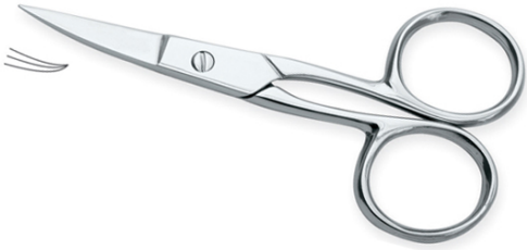
Nail Scissors Straight Heavy Duty VI-109-1001

&nbsp;&nbsp;&nbsp;Heavy Duty Nails Scissors are designed for the perfect cut even for the thick and strong nails and this model is also very well received in Embroidery line. Made from Special Stainless steel gives it long lasting cutting ability. 4", 4½"