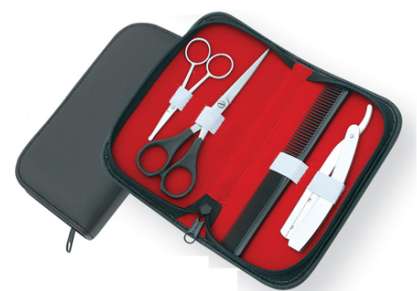
Manicure Kits VI-115-1018

Professional Manicure Set Contains: Nail Nippers Cuticle Nippers # 911 Nail File # 105