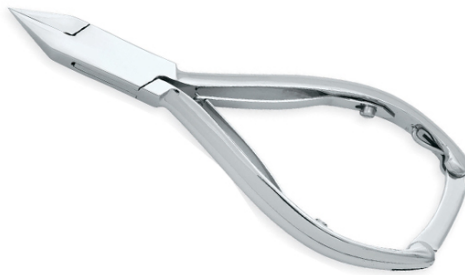
Cuticle Nippers VI-114-1011

Forged from Surgical Grade Stainless Steel with Box Joint, Double Sheet Springs and very sharp pointed cutting blades for ingrown nails. 4.5", 5", 5.5", 6.25",