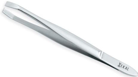
Plane Eye brow Tweezers VI-112-1004 Plane Eye brow Tweezers 3", 3.5", 4",