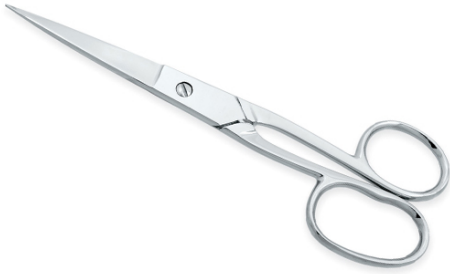
Sewing Scissors Pointed VI-108-1001

&nbsp;&nbsp;&nbsp;Sewing Scissors with two pointed blades is available in Size 8&rdquo;, 10&rdquo; for various uses at home or for the industrial purpose. This Scissors is made out of high carbon Stainless Steel alloy which gives it long lasting sharpness 8", 10",