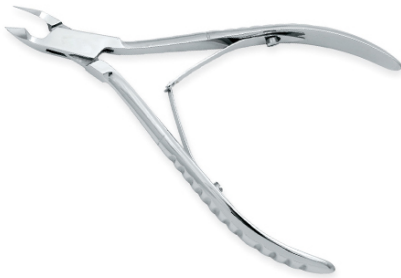
Cuticle Nippers VI-114-1022

Forged from Surgical Grade Stainless Steel with Box Joint, Single Sheet Spring and with rounded smooth shape 4",