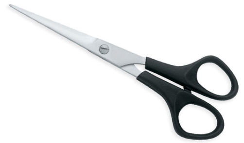
Standard Thinning Scissors VI-104-1003

Made from Selected steel and machined to perfection for smooth thinning operation with 22 teeth double blade thinning Scissors 6",