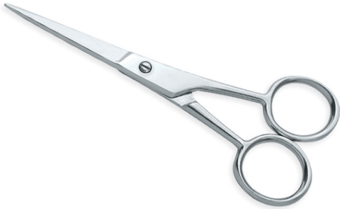
Standard Thinning Scissors VI-104-1001

Made from Selected steel and machined to perfection for smooth thinning operation with 22 teeth single blade thinning Scissors: 6",