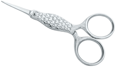
Fancy Scissors VI-107-1013

&nbsp;&nbsp;&nbsp;Beautiful design and excellent working ability is one of the features of our range of Fancy Scissors which are made out of Special Steel for long lasting cutting ability 4",