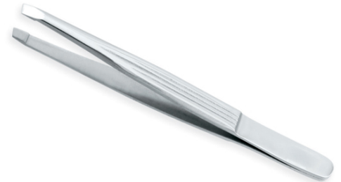
Eye Brow Tweezers VI-112-1009 &nbsp;Eye Brow Tweezers 3.5",