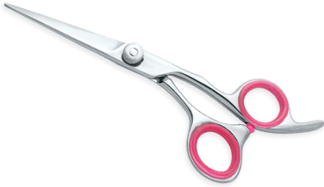
Sword Professional Barber Scissors VI-101-1025

Available in Stainless steel AISI 420 or 440 with hollow ground inner blades and Convex edge, an ultimate samurai shape model for perfect cut. 6",