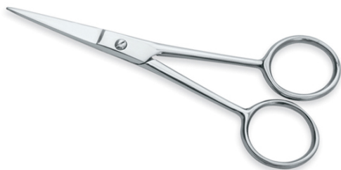
Dissecting Scissors VI-111-1004

&nbsp; Blades of this utility Scissors are made out of high Carbon Japanese Stainless Steel Sheet and handles with Plastic, One blade micro serrated makes these Scissors perfect to cut anything from paper to heavy cloth or bandage in case of any emergency. 6",