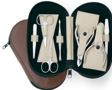
Manicure Kits VI-115-1005

Professional Quality kit with fine quality manicure and pedicure instruments packed in combination of leather, available in different combinations of leather.<br />