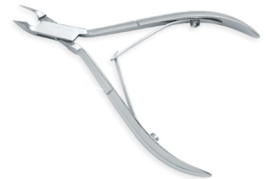
Cuticle Nippers VI-114-1024

Forged from Surgical Grade Stainless Steel with Lap Joint, Double Sheet Spring and finished to perfection 4.5",