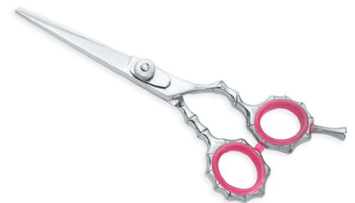
Star Professional Barber Scissors VI-101-1024

Available in Stainless steel AISI 420 or 440 with hollow ground inner blades and Convex edge, One of our best sellers of all times. 5.5", 6",