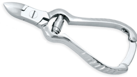
Cuticle Nippers VI-114-1026

Forged from Surgical Grade Stainless Steel with Box Joint, Double Sheet Spring and finished to perfection 4",