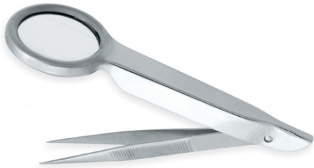
Splinter Tweezers VI-112-1007 &nbsp;with magnifying glass 3",