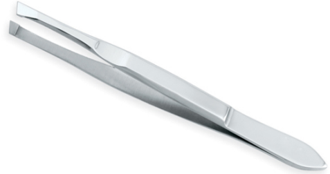
Eye Brow Tweezers VI-112-1014 Eye Brow Tweezers 3.5",