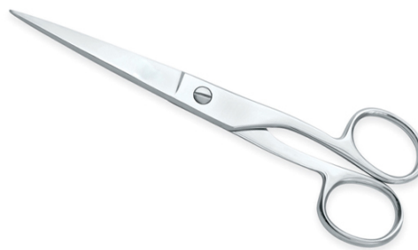
Household with Pointed VI-108-1011

&nbsp;This Classic model of Kitchen Scissors is available in two options. For quality conscious market we offer Forged Scissors with excellent quality and for Economy markets we offer Casted Scissors with standard quality. <div>&nbsp;</div> 8",