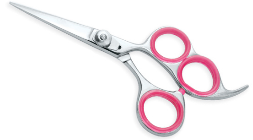
Three Finger Professional Barber Scissors VI-101-1003

&nbsp;Available in Stainless steel AISI 420 or 440 with hollow ground inner blades and Convex edge, Little heavy than most of the models and ideal for people who want to work with little heavy Scissors. 6.5",