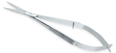
Embroidery Scissors Straight VI-107-1024

Beautiful design and excellent working ability is one of the features of our range of Fancy Scissors which are made out of Special Steel for long lasting cutting ability. 3.5",