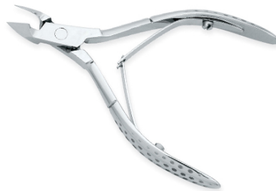
Cuticle Nippers VI-114-1023

Forged from Surgical Grade Stainless Steel with Lap Joint, Double Sheet Spring and finished to perfection 5",