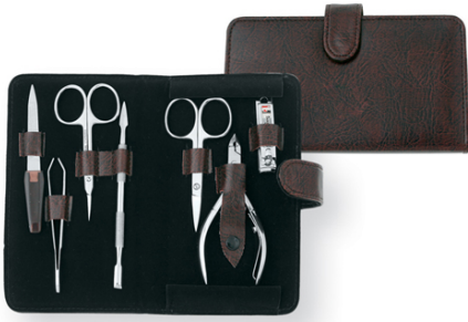
Manicure Kits VI-115-1013

Manicure Set Contains: Nail Nippers Cuticle Nippers # 911 Nail Scissors # 858 Cuticle Pusher # 144