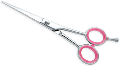
Conventional Style Professional Barber Scissors VI-101-1001

&nbsp;Available in Stainless steel AISI 420 or 440 with hollow ground inner blades and convex edge, Detachable finger rest makes it favorite choice for the stylists who prefer simple and conventional models 5", 5.5", 6",