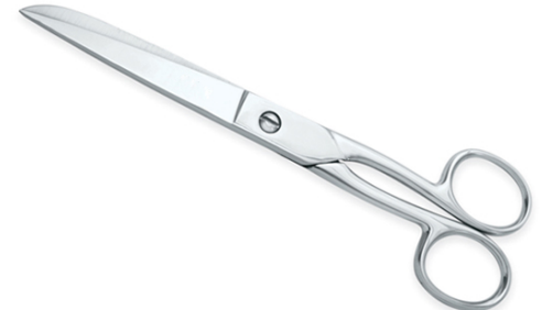
Household Scissors VI-108-1006

&nbsp;&nbsp;&nbsp;Household Scissors is available in assorted sizes for the varied operations for the household as well as for the industrial purposes. Excellent craftsmanship makes these scissors a special one to be used for comfort and ease. 4", 5", 6", 7",