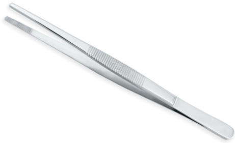
General Purpose Tweezers VI-113-1001

This classic model with serrated rounded tips is used for various purposes from surgical to assembly line and it's available in magnetic and non magnetic steel type. 4", 4.5", 5", 5.5", 6", 7", 8", 10", 12",