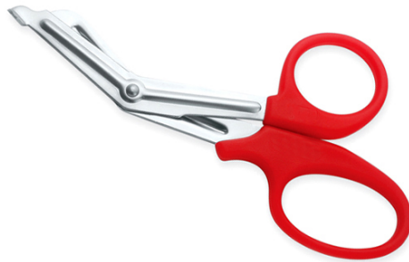
Utility Scissors VI-111-1002

&nbsp; Blades of this utility Scissors are made out of high Carbon Japanese Stainless Steel Sheet and handles with Plastic, One blade micro serrated makes these Scissors perfect to cut anything from paper to heavy cloth or bandage in case of any emergency. 6",