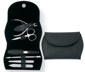
Manicure Kits VI-115-1015

Manicure Set Contains: Nail Nippers Cuticle Nippers # 911 Nail Scissors # 852