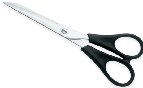
Household Scissors with Plastic Handles VI-108-1008

&nbsp;Sewing Scissors is available in assorted sizes for the varied operations for the household as well as for the industrial purposes. Excellent craftsmanship makes these scissors a special one to be used for comfort and ease..... 6",7,8",