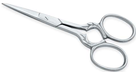
Fancy Scissors VI-107-1016

&nbsp;&nbsp;&nbsp;Beautiful design and excellent working ability is one of the features of our range of Fancy Scissors which are made out of Special Steel for long lasting cutting ability 3. 5",