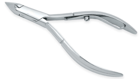
Cuticle Nippers VI-114-1021

Forged from Surgical Grade Stainless Steel with Box Joint, Double Sheet Springs and with texture on handles for grip 4",