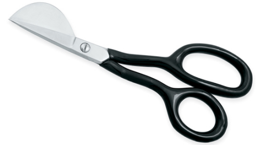
Candle Shears VI-111-1009

• It's ergo design and made out of special steel with handles dipped in rubber comes with excellent craftsmanship, this scissors is a must for any line of utility Scissors. This is heavier version and we also have a lighter version of the same.