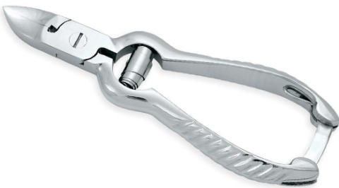
Cuticle Nippers VI-114-1004

Forged from Surgical Grade Stainless Steel with Lap Joint, Single Wire Spring and finished to perfection. 4", 4.5", 4.75",