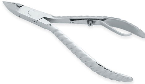
Cuticle Nippers VI-114-1020

Forged from Surgical Grade Stainless Steel with Lap Joint, Single Wire Spring and light handles for smooth operations 5",