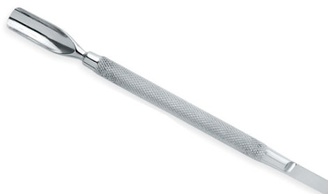
Cuticle Pushers & Cleaners VI-116-1005

Cuticle Pushers Double Ended made of surgical grade stainless steel of Japanese origin makes these tools truly professional and surgical grade allows you to sterilize these after every use.