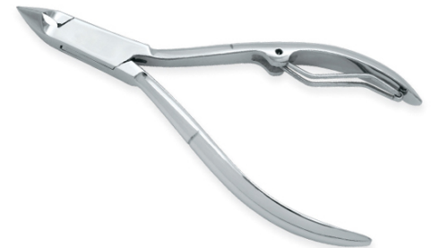
Cuticle Nippers VI-114-1018

Forged from Surgical Grade Stainless Steel with Box Joint, Double Sheet Spring and lock back handles for professional work. 4.5",