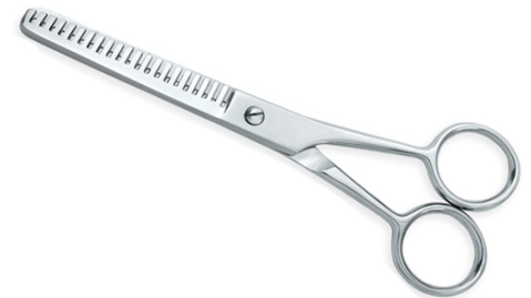
Thinning Scissors VI-102-1018 &nbsp; Thinning Scissors 6",

&nbsp; This Economy model of plastic handle thinning Scissors is ideal for the economy market and for quality conscious customers we request to see our line of professional thinning Scissors. 6",