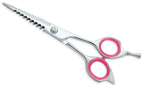
Professional Scissors cum razor VI-102-1010

Available in Stainless steel AISI 420 or 440 with hollow ground inner blades and Convex edge, Double blade thinning scissors with 32 blades for a smooth operation. 6",